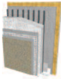
FlexWall WM System

The tremendous design flexibility, color and texture selection, integral shapes, speed of construction and reliable performance have made EIFS, stucco and Acrylic Surfacing Systems the best values available to commercial construction. Now, with the addition of BASF's unmatched true single source cladding & sealant warranty, SonoWall's are clearly the superior values in wall systems.